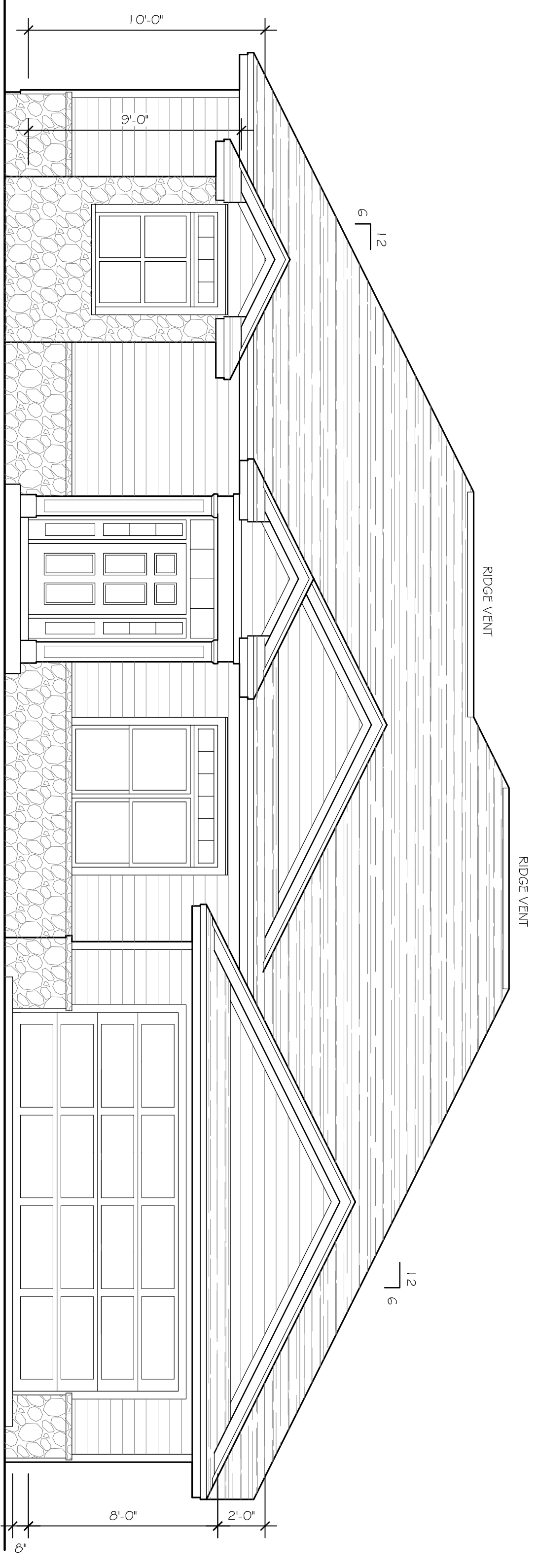
1 FRONT (SOUTH) ELEVATION 1/4" = 1'-0"

All construction shall comply with the Florida Building Code (Edition 5), National Electrical Code (2014), NFPA 101 Life Safety Code w/ Florida Modifications, and Florida Fire Prevention Code.